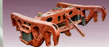
Machined & Assembled Freight Wagon Casnub