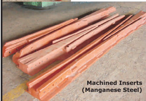
Machined Inserts (Manganese Steel)