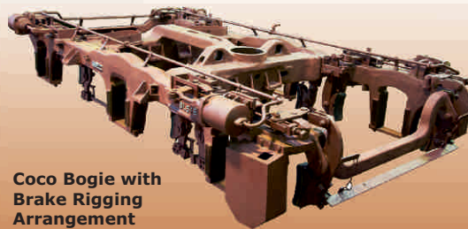
Coco Bogie with Brake Rigging Arrangement