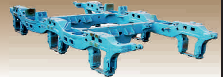
Locomotive Machined Flexi-coil Bogie