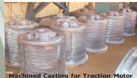
Machined Casting for Traction Motor