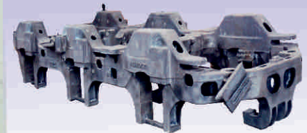
Machined Tri-Axle Bogie Frame