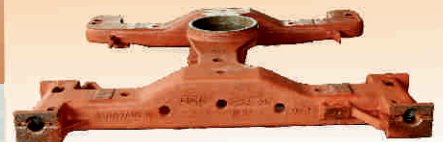
Machined CS Bolster